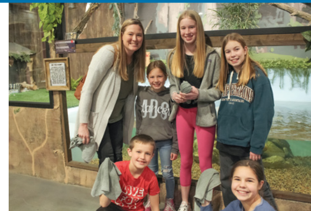
Members volunteering at the Twin Falls Zoological Center, Idaho.

If approved, Modern Woodmen covers premiums for all life insurance certificates owned and paid for by the member and/or the member's spouse. Find the application form at modernwoodmen.org/financialrelieffund .